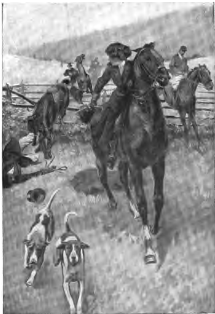
"Turning, she saw Mrs. Cheyne's horse go crashing through the fence."